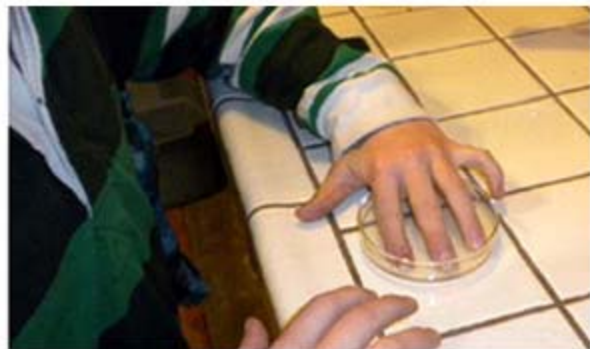
I am pressing my fingers on the agar.